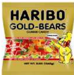
Sweets & chocolate