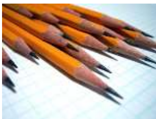
Pens & Pencils

Tick the items that you will need and be allowed to have. Cross the items that you won't be allowed or won't need in lessons. If you aren't sure put a question mark next to each item.